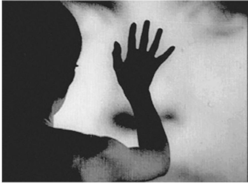
FIGURE 3. Episode 2B: From Bergman's Persona

It is, in this regard, typical of Histoire(s) . The interplay of Brooks, Bergman, and Godard himself is the sort of thing we are asked, repeatedly, to accept as historical evidence. Fantastic and singular though it may be, its congruence of multiple images is said to betoken something about the world. In this case, as we shall see, the claim has to do with an alleged relation between developmental psychology, human embodiment, and the techniques of twentieth-century cinema. Even without going into details, however, it is clear that this is going to be a big pill to swallow. In evaluating the claim, the issue will be whether a procedure that looks suspiciously like formalism—the articulation of patterned relationships between images—might actually constitute historiography. 7 Godard claims that it does. He claims, in fact, that such relationships instance historical processes.