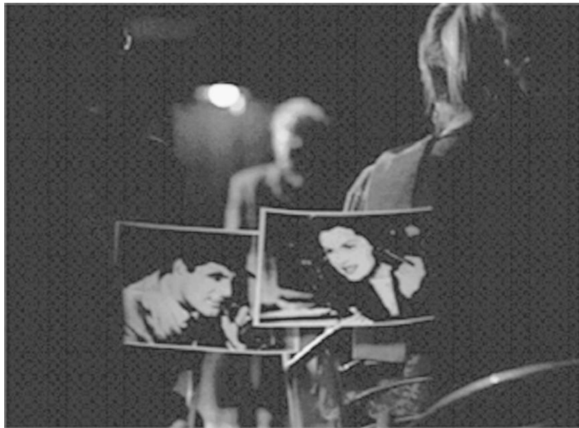
FIGURE 10. Notre Musique : Godard (in background) lectures on montage. The stills are from His Girl Friday .