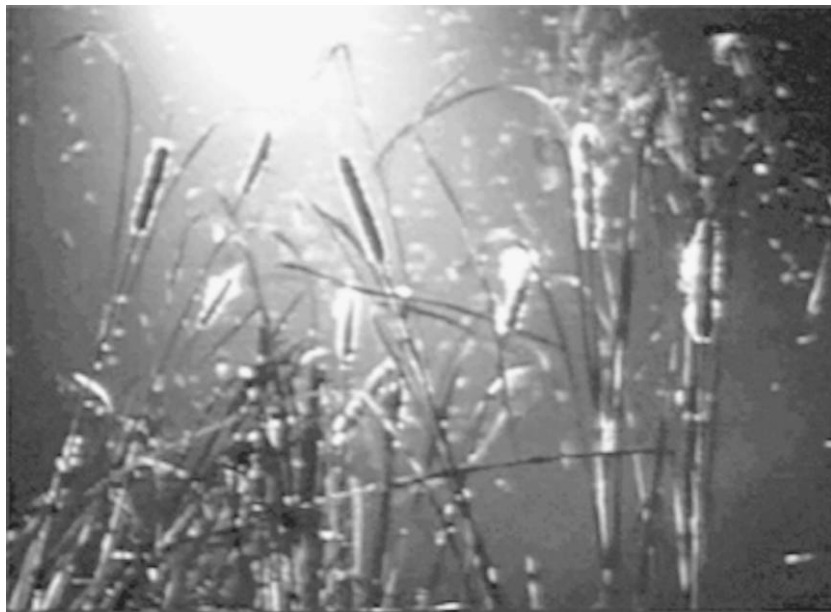
FIGURE 7. Episode 2A: Night of the Hunter