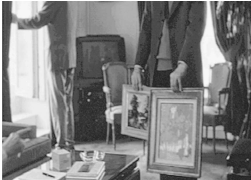
FIGURE 9. Eloge de l'amour : Rosenthal (offscreen lower left) attributes a painting.

In Éloge de l'amour , the art dealer Rosenthal is reassembling a collection of paintings dispersed during the war—an act of montage, if only metaphorically, and of telling off items on a list. We see his assistant holding two small canvases, moving them slowly back and forth so that Rosenthal (offscreen) may compare them (fig. 9). His lawyer, Forlani, inquires, “Who’s that—Delacroix?” Rosenthal replies, “I believe Matisse [ Je crois Matisse ]” ( É , p. 15). This attribution does not appear as showy expertise but as an offhanded credo (“I believe”). 71 Rosenthal illustrates Godard's imperative to the monteur , “to see two things and to choose between them in completely good faith .” Some years later, in Notre Musique , a very similar shot appears