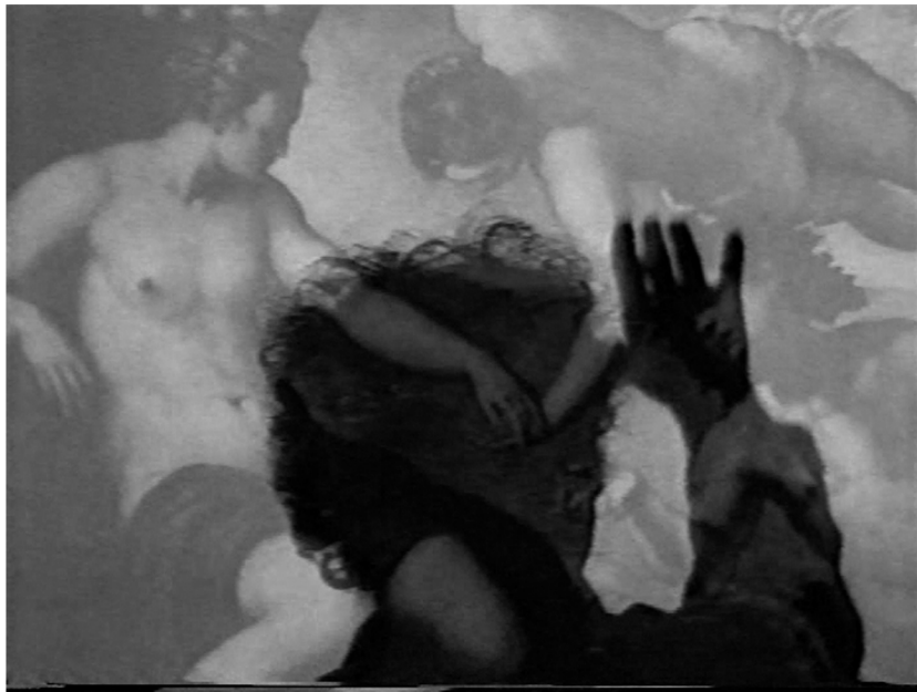
FIGURE 4. Scénario du film Passion : Godard's silhouette + Tintoretto's Bacchus, Ariadne, and Venus (1576)