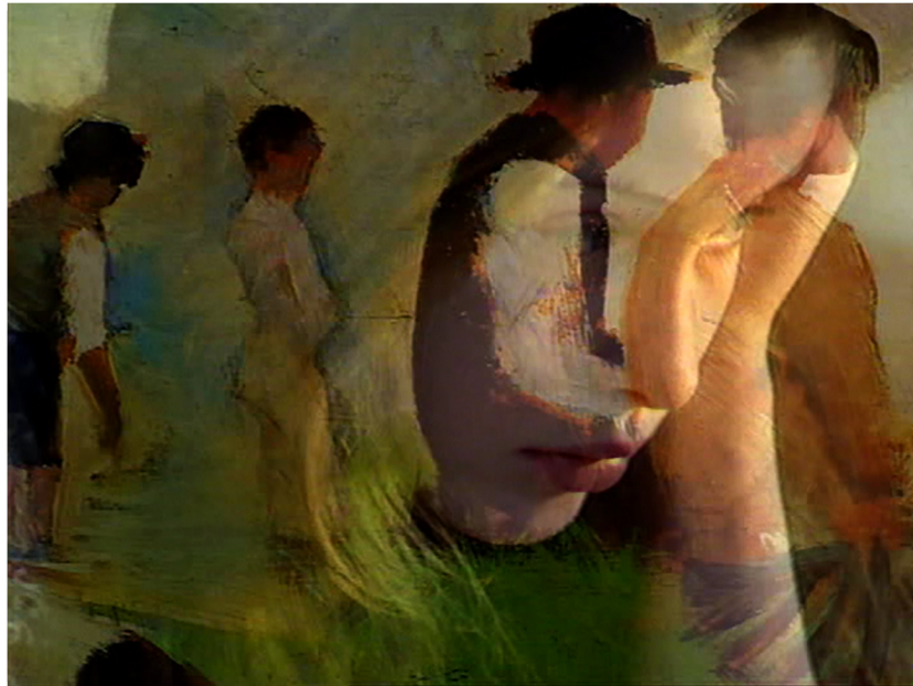
PLATE 3. Episode 2A: Delpy + Seurat