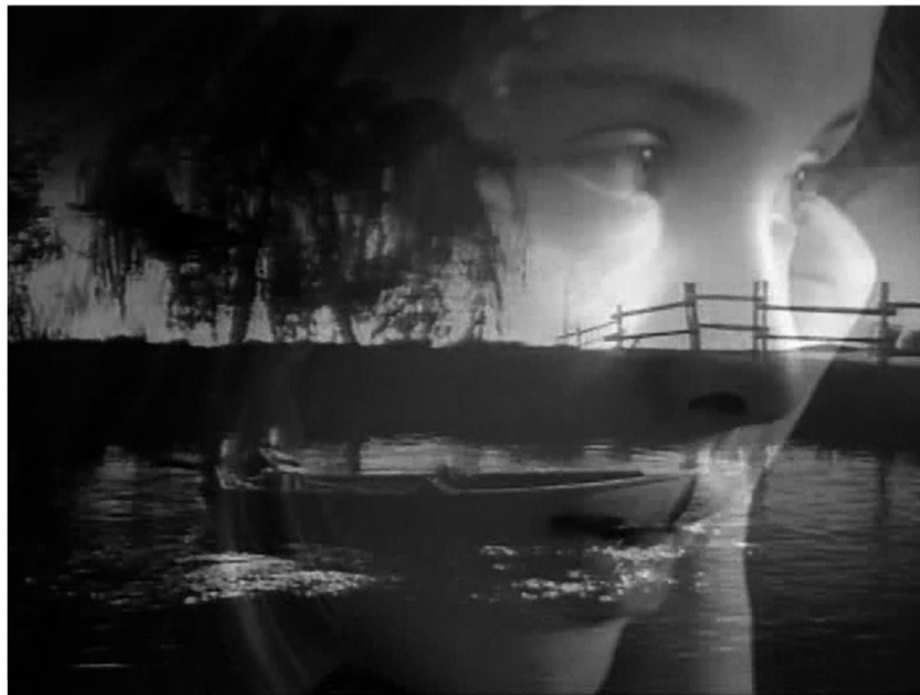
FIGURE 8. Episode 2A: Delpy + Night of the Hunter (boat for mouth, willows for hair)

Histoire(s) essays this relationship. If the Persona sequence shows “the history of oneself” as a history of thinking with the hands, then “Envoi 1” is a case study in “the history of everyone.” That is, if cinema names the criteria of the real at a particular historical juncture, then “Envoi 1” investigates those criteria by narrating a particular historical process: the growth of cinema. Hence the title. It is an envoi because the criteria it investigates are