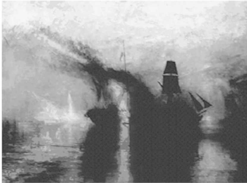
FIGURE 6. Episode 2A: J. M. W. Turner, Peace (Burial at Sea) , 1842