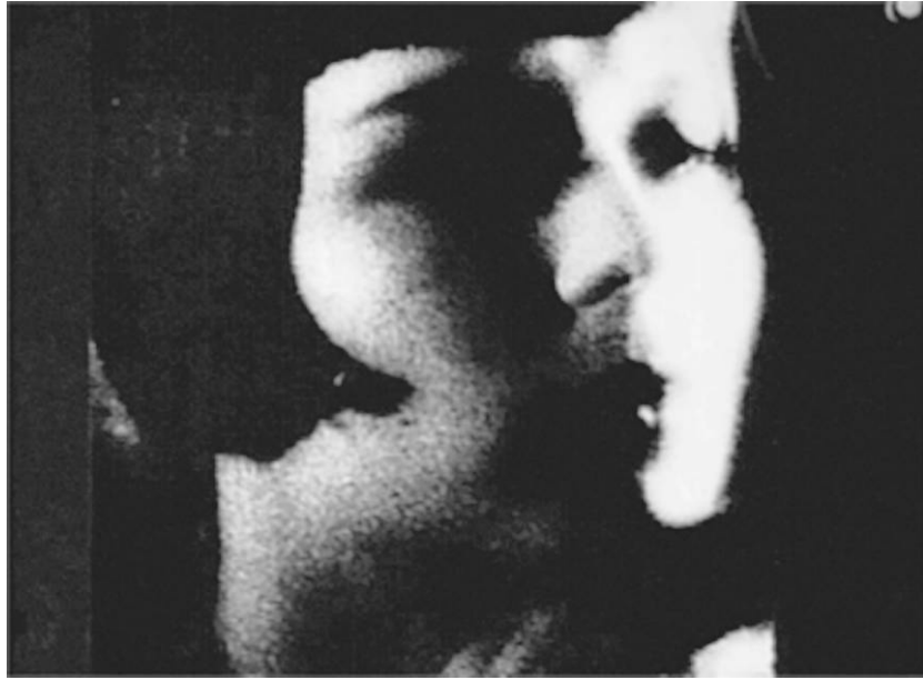
FIGURE 1. Episode 2B: Louise Brooks