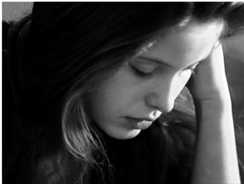
FIGURE 5. Episode 2A: Julie Delpy