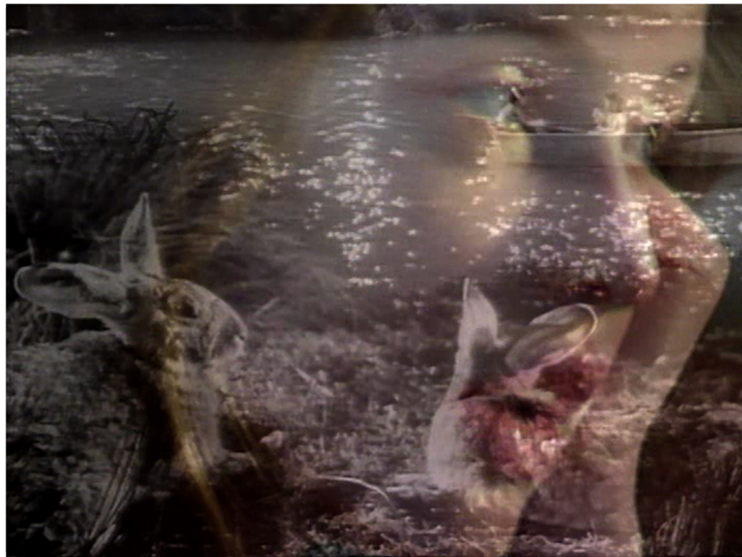
PLATE 4. Episode 2A: Delpy + Night of the Hunter (boy's head as iris)