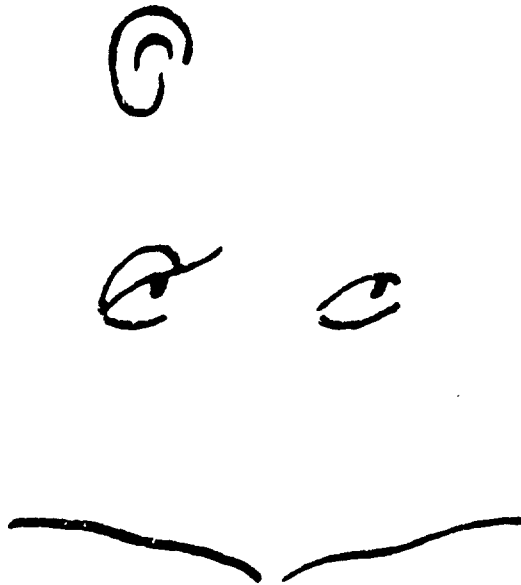
Fig. 1: Drawings by Beazley: Some distinctive traits of the Villa Giulia Painter. After Beazley 1912. 239.

The above is merely an excerpt from a much longer schedule of forms; indeed, many of the early essays consist almost entirely of such listings, with little or no additional commentary. They often come with Morelli-esque drawings. ( Figures 1 and 2 ) Unlike Morelli, however, Beazley determines these traits comparatively: he sifts particular systems of rendering out from the larger corpus of Attic pottery. "The process of disengaging the work of an anonymous artist," he wrote, „is the same as that of attributing an unsigned vase to a painter whose name is known. It consists of drawing a conclusion from observation of a great many details: it involves comparing one vase with another, with several others, with all the vases the enquirer has seen." 27