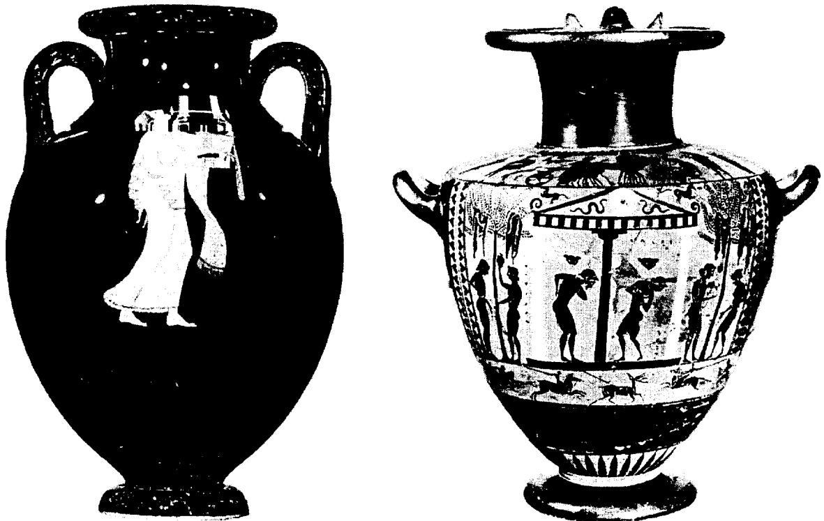
Fig. 5 (left): Amphora by the Berlin Painter. ARV 2 196.3; Para 177, 342; Add 2 190.

lengthy justification of connoisseurship itself. (Figure 5) Beazley starts off by sorting out a group of vase-paintings on the basis of morphological similarities, and then goes on to suggest three possible ways in which those vases might have been produced: "The whole group," he writes, "... may consist of substantive works [original in design, style and execution]; or of copies [original in execution but not design or style]; or of translations [original in execution and style but not design]; or of any two; or of all three." 51 Naturally he lumps for the first possibility, 'substantive works' by the Berlin Painter, but it is interesting to note his reasoning in excluding the other two.