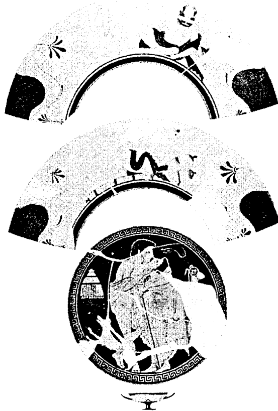
Fig. 3 (left): The namepiece of the Villa Giulia Painter . ARV 2 618.1; Para 398; Add 2 270.